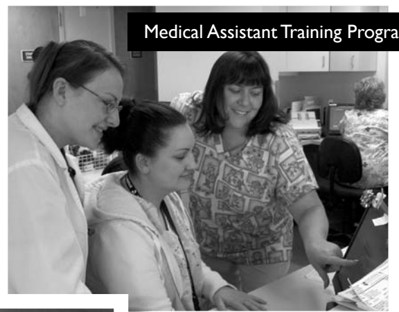
Medical Assistant Training Program