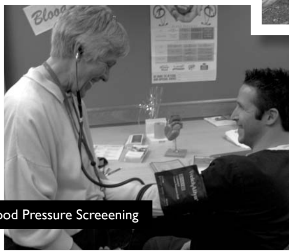
Blood Pressure Screening