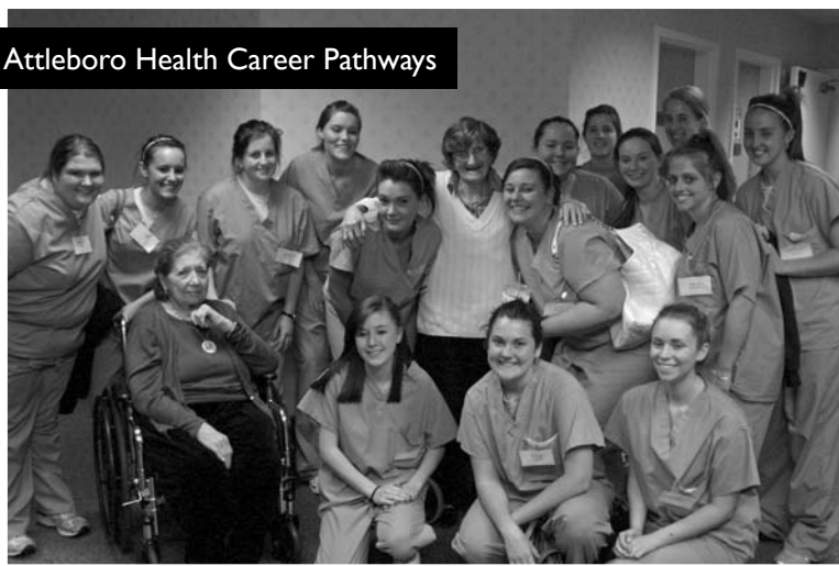
Attleboro Health Career Pathways